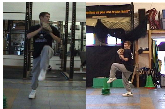
We can do a two camera shot where ever possible!

College CD's: Developing your skills is only part of becoming the best athlete you can be. Now you have to get that info to the right people! Get a CD made of all your skills put together professionally so you can impress your coaches!