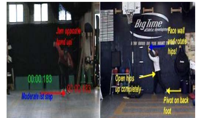
We can do video clips of anything and break it down frame by frame for evaluation or instruction!